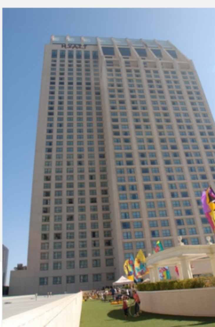
The tower of the Manchester Grand Hyatt San Diego will be the site of a Saturday charity event in which participants will rappel from the 33rd floor to the pool deck of the hotel.